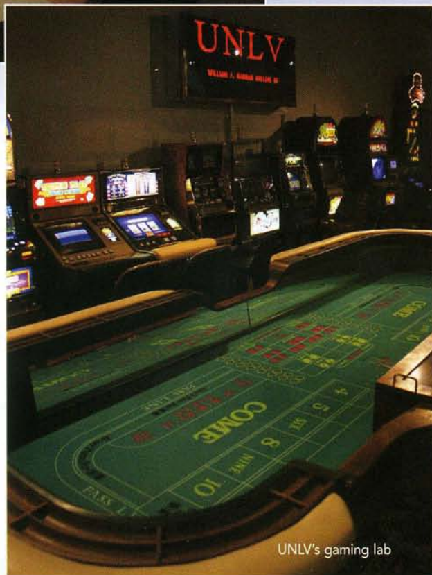
UNLV's gaming lab

The International School of Hospitality is uniquely structured offering seldom-found courses in the hospitality industry. Designed with classroom and online programs, TISOH operates in conjunction with the Hospitality Outreach Services Division of UNLV's William F. Harrah College of Hotel Administration. All students who successfully complete their desired course will receive