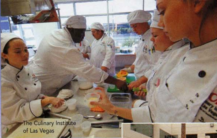
The Culinary Institute of Las Vegas

The Crescent School of Gaming and Bartending is far from being a newcomer to educating students in the hospitality field. Established in 1983 in New Orleans, this school has expanded to