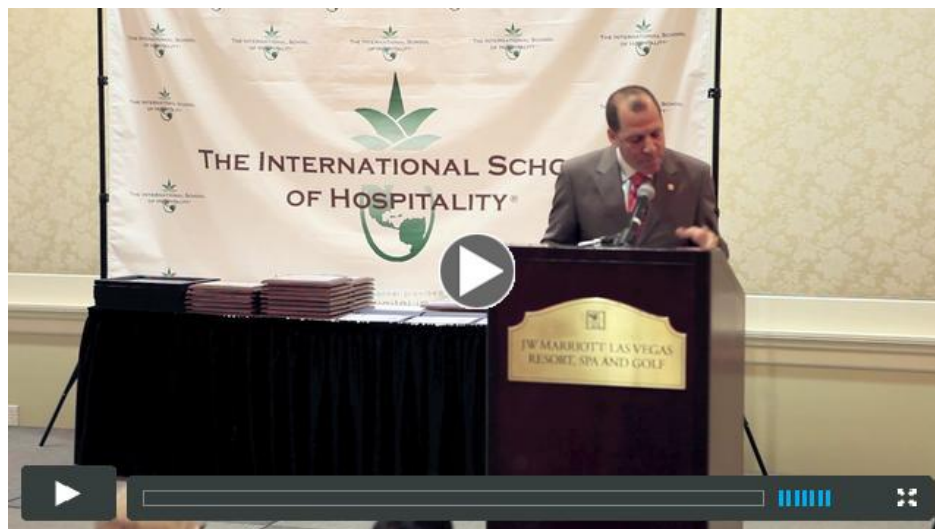
TISOH Fall 2011 Graduation - "Let Your Journey Begin!"